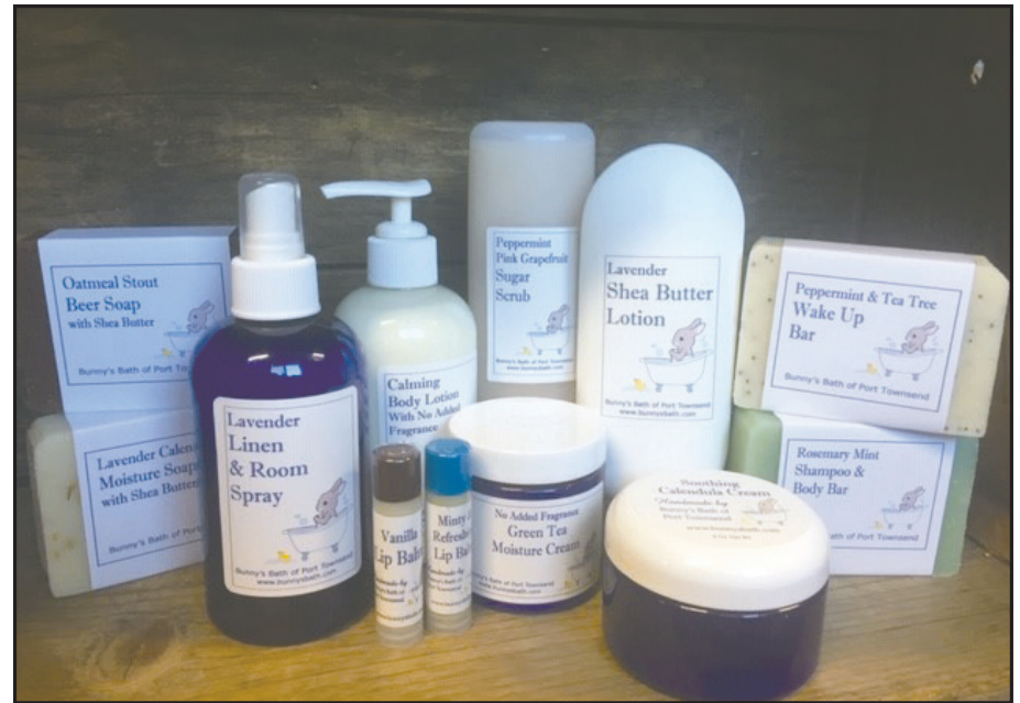
Bunny's Bath offers diverse lines of natural skincare products.

the outstanding customer service they receive.