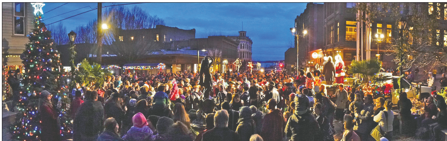
Downtown Port Townsend will soon be lighted up and decked out for the holidays.

Supporting Small Business & Toys for Tots